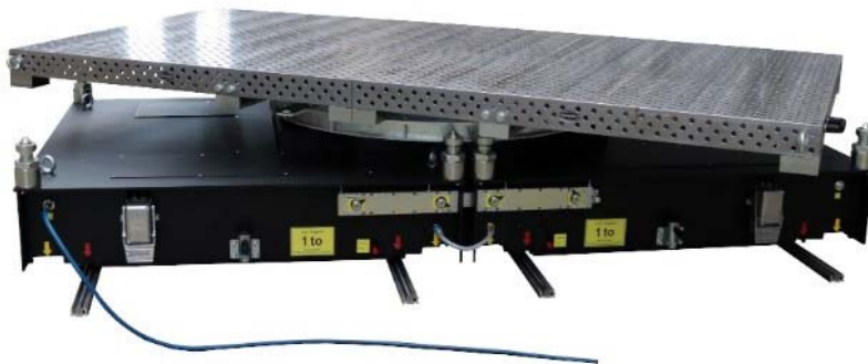
Caption 1: Trolley with manual rotating platform for high-precision feeding of a laser welding cell

The intra-logistics specialist LOSYCO has expanded its LOXrail system, adding a new automatic trolley with a rotating loading platform for flexible orientation of heavy workpieces directly on rails. This solution, which has already been successfully implemented in a machine factory, increases flexibility in assembly line layouts and simplifies the adaptation of the rail transport system to existing production lines and floor plans. The new trolley can be realized in different dimensions according to customer requirements. It enables manual or motor-driven rotation and orientation of payloads up to 10 tons. Application areas include laser and robot welding cells, measuring machines, feeding systems and other production systems requiring highly precise positioning and easy access to workpieces. The turntables can be powered via drives installed at the respective work stations or onboard drives fed via cable, energy guiding chain, battery or induction. LOSYCO is thus expanding its adaptable range of LOXrail-based transport systems for production logistics, material flow and machine loading and unloading, which ranges from manually moved trolleys to shuttles and transport platforms with sensor-controlled automatic braking to versions with mechanical or semi-automatic steering.